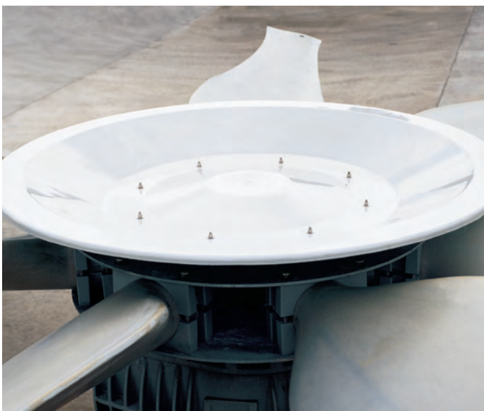
The HP7000 seal disc design helps enhance aerodynamic efficiency